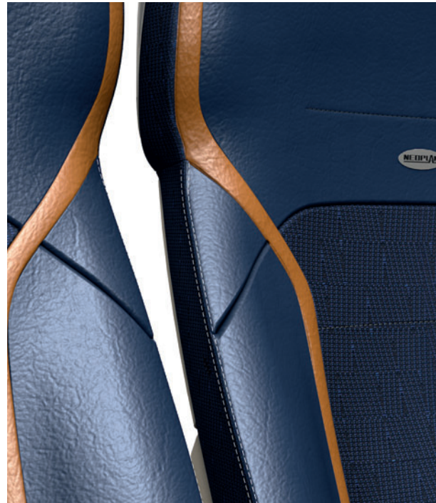
Triangle element in leather