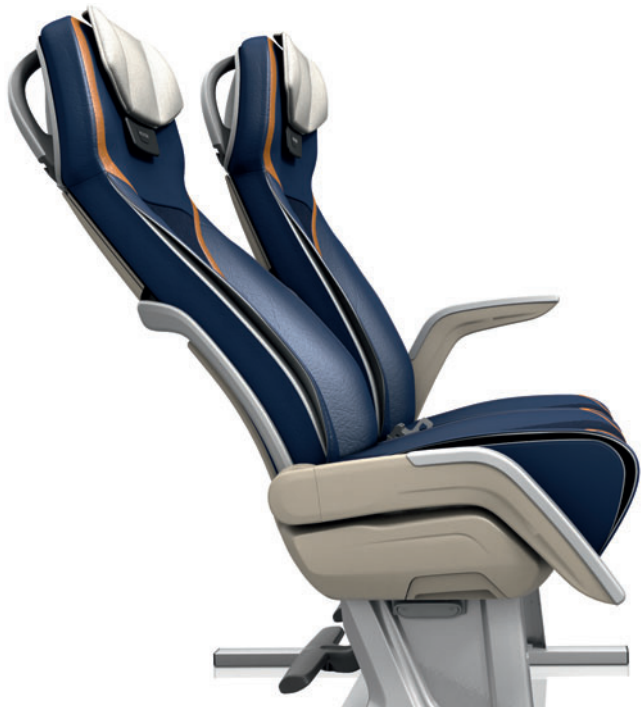
Backrest adjustment with seat angle adjustment