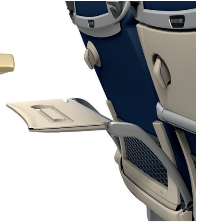
Free-standing folding tables