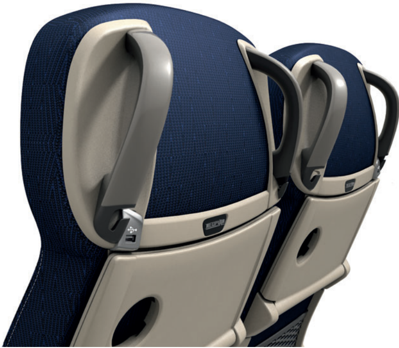
Grab handles in Pearl mouse grey