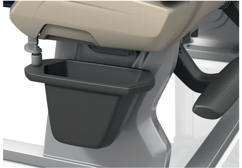
Fold-out waste bin